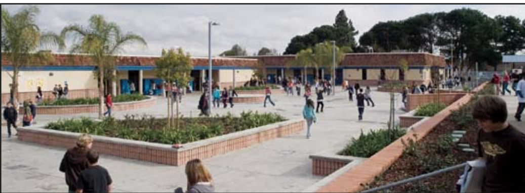
Sequoia Middle School's new interior plaza easily accommodates school assemblies.

During the summer of 2007, the interior plaza of Sequoia Middle School was completely replaced and landscaped. What was once an unattractive space featuring narrow sidewalks, sparse grass and overgrown trees was transformed to an open and eye-catching space.