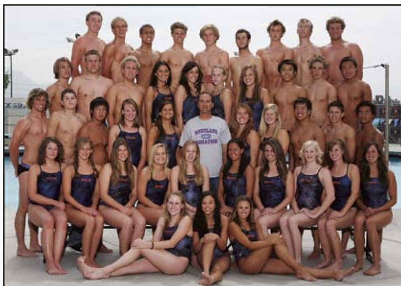
The Westlake High girls' swim team, shown here with the boys' team, won a CIF championship in 2007.