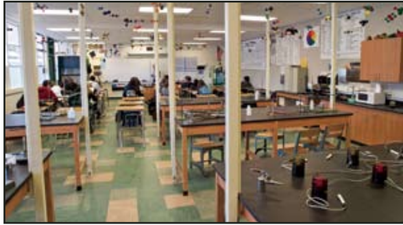
The TOHS science labs were modernized.

At Westlake High School, projects also included the replacement of many underground