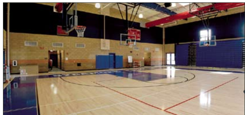
Sycamore Canyon School has a new gymnasium.