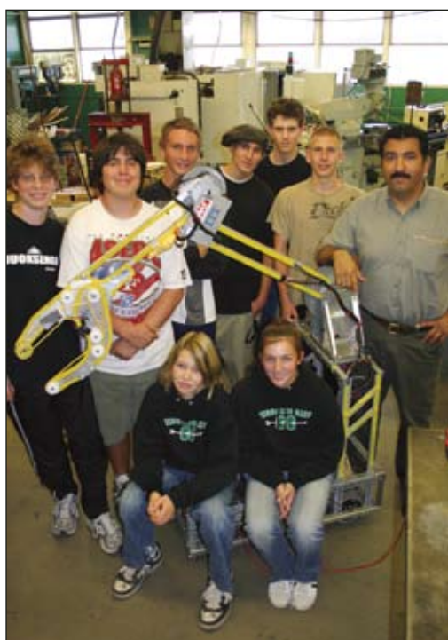
The Conejo Valley Robotics Club works with one of their latest creations.